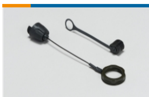
Fiber Connector Covers & Caps(1)